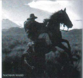
An Andean cowboy rounds up fighting bulls at the foot of the Cotopaxi Volcano, Ecuador.

The specific volunteer opportunities available depend on the individual's experience and availability. Preference is given to long-term volunteers. Short-term volunteers may work with ongoing community projects or teach English